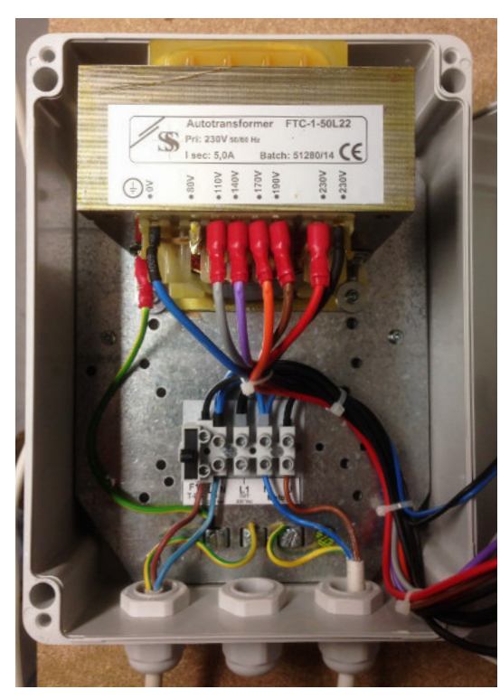
When wiring is complete controller should appear as above.