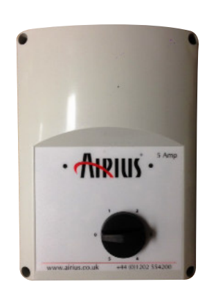
SPEED CONTROLLER (FULLY ASSEMBLED)