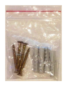
4 x SCREWS AND WALL PLUGS FOR WALL MOUNTING