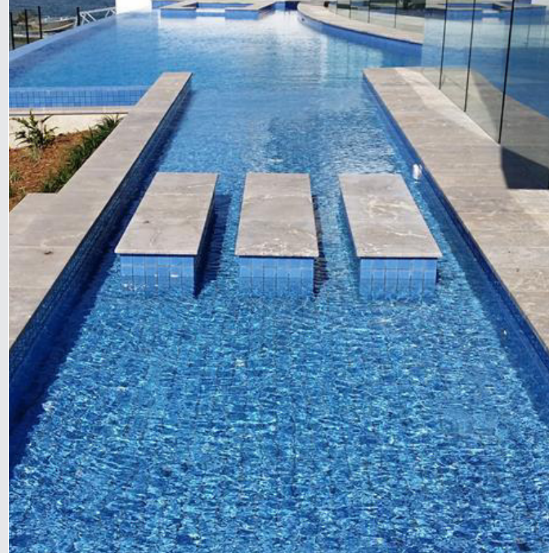
More of PacPines Pool's customers...